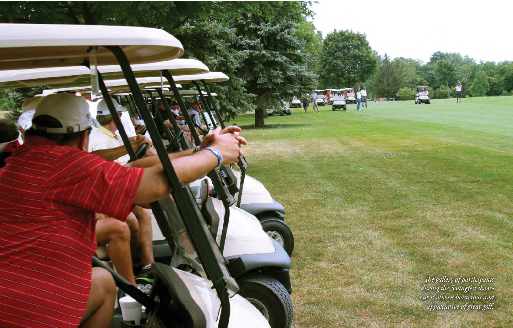
The gallery of participants during the Swingfest shoot-out is always boisterous and appreciative of great golf.