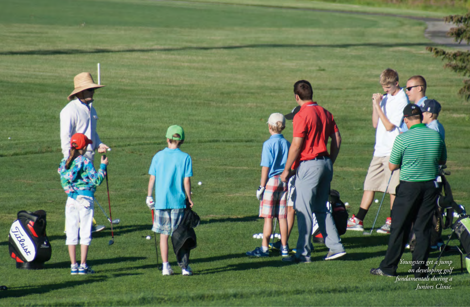
Youngsters get a jump on developing golf fundamentals during a Juniors Clinic.