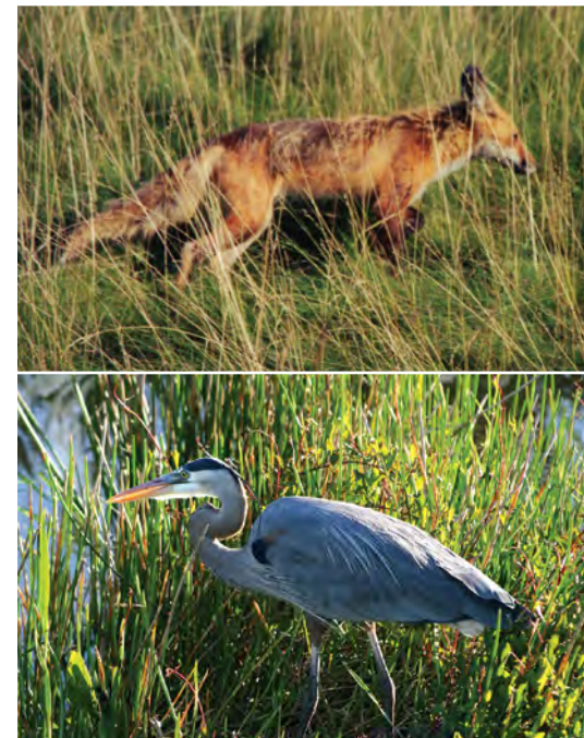
Members and guests aren't the only ones enjoying the naturally peaceful settings at Old Oakland. Deer, fox, coyotes and birds of all sorts make their home in the many natural habitats found on the courses.

Old Oakland also participates in reciprocal play networks, allowing members the chance to play at hundreds of courses around the country – some of the very best courses available.