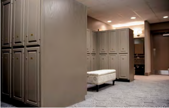
Newly renovated locker rooms give members a place to freshen up and provide storage space for personal belongings.